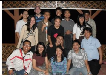
Celebrating my 1 year anniversary

If you want to see more pictures, check my Facebook page, or I can send you a link. Also, check my blog for more pictures and stories. www.takingthelight.blogspot.com