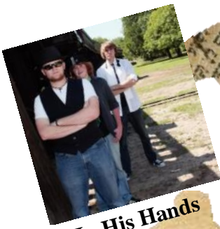
In His Hands Worship (Youth Rally & DNow)