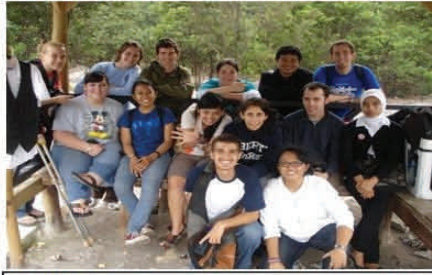
With friends, hiking near the crater

Look for more pictures on Facebook! And I now have faster internet at home, so if you want to talk on Skype, just let me know and we can set up a time.